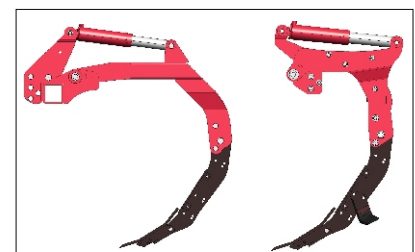
Scheme of the shanks with hydropneumatic "NON STOP" system