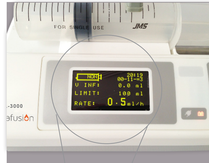
Large & Bright OLED Display.