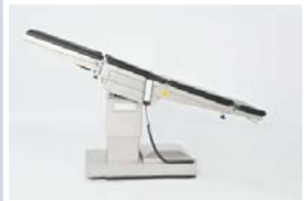
Trendelenburg position : 0 - 18°