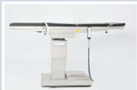
Maximum height : 111 cm