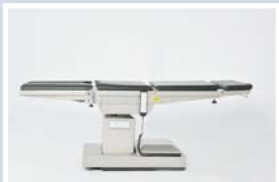
Minimum height : 71 cm