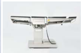
Tilt right : 18°