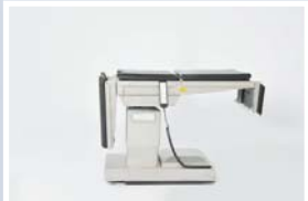
Leg plate up / down : 10° / 90° Head plate up/down: 50° / 90°