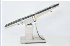
Anti - trendelenburg position : 0 - 18°