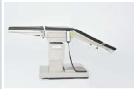
Back plate down : 0 - 22°