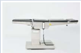
Longitudinal slide of tabletop : 15 cm