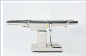
Longitudinal slide of tabletop : 15 cm