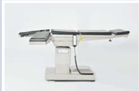
Leg plate horizontal extension : 90°