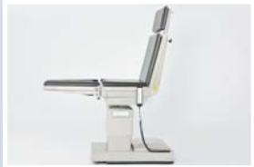
Back plate up : 0 - 75°