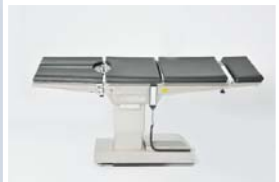
Tilt left : 18°